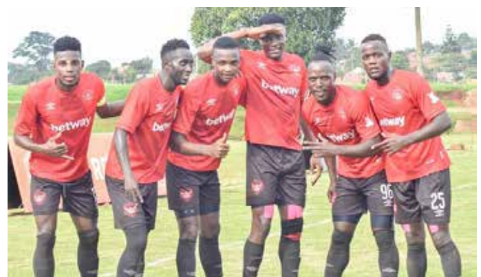
Express FC players celebrate a goal at Muteesa II Stadium, Wankulukuku.