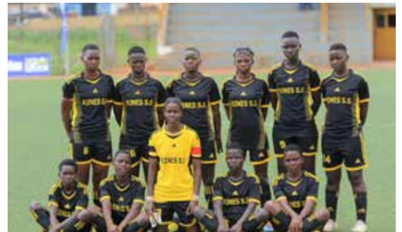
Rines SS WFC finished second and won promotion to the FUFA Women Super League