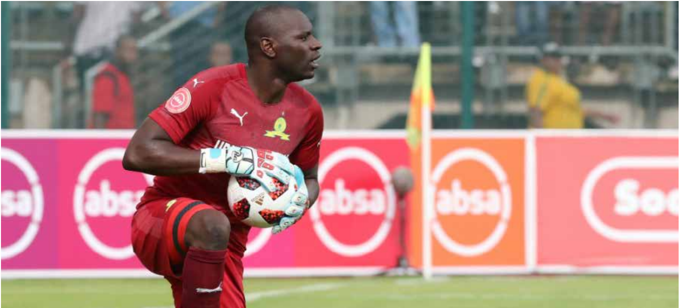
Former Uganda Cranes captain Denis Onyango on duty at Mamelodi Sundowns

It is a dream for all players to join paid ranks. Some of Uganda's ambassadors on foreign land have had their seasons come to a conclusion with smiles. Here is a recap of their great show.