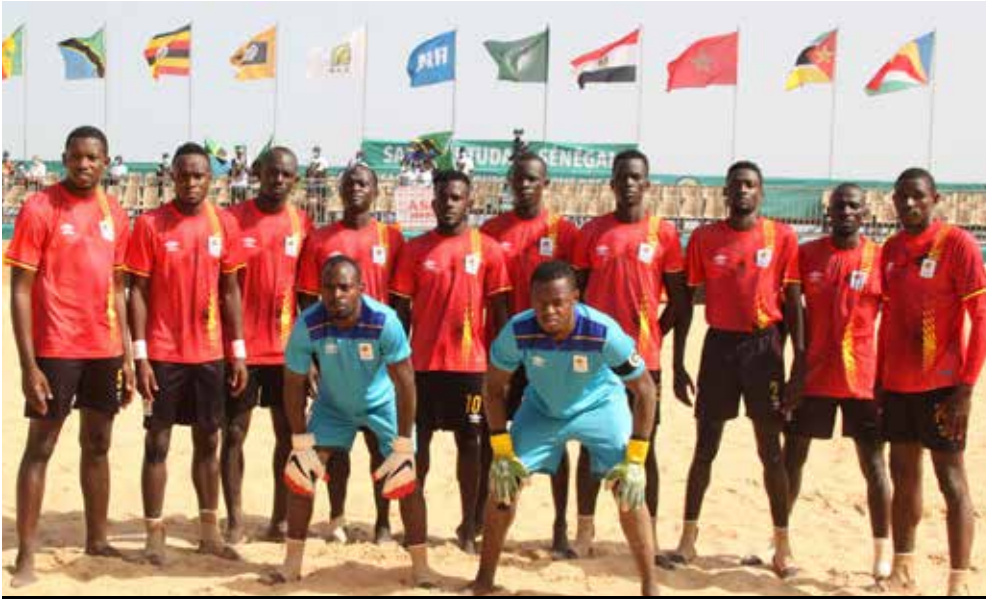
Sand Cranes made their debut at the Africa Beach Soccer Championship this year in Senegal

Playing at the Africa Beach Soccer Cup of Nations was itself an achievement for the Sand Cranes. For a game that made its baby steps in 2010, featuring at the coveted African showpiece 11 years later was a journey worth moving.